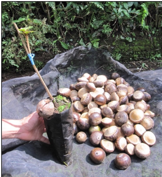
A grafted selection of Q. insignis by Ricardo Romero of Las Cañadas, with acorns from the ortet.

Grafting is an ancient cloning technique. A twig or bud from the tree you wish to propagate is carefully inserted into a matching cut in a seedling tree, or sometimes a mature tree which has been cut back (this is called “topworking”). The resulting tree will be genetically identical to the original tree. Grafting is used to propagate most temperate tree fruits and nut species.