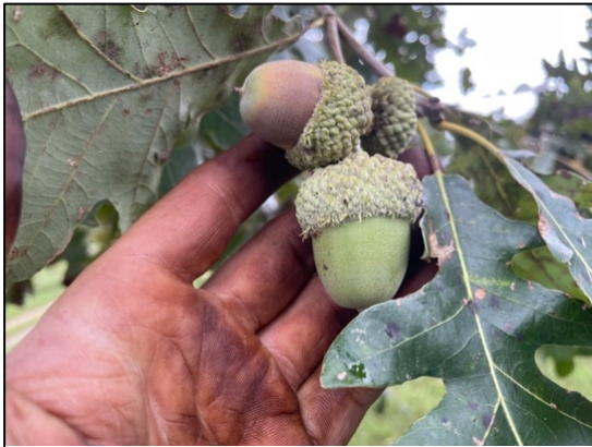
'Ooti F1, selected by Lucky Pittman, produces large, sweet acorns.

An ideotype is the ideal form and behavior a plant breeder is looking for. It’s sort of the goalpost the breeder is aiming towards, whether selecting from wild trees, seedlings of elite trees, or doing active crosses. There’s not one oak ideotype breeders are looking for, but rather a number of different goals with associated traits.