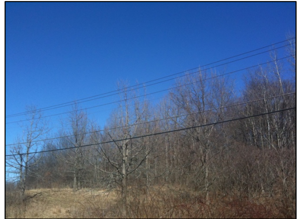
'Ashworth' seedlings at New England Small Farm Institute in Massachusetts, USA. Planted as part of state-funded "Fruition" project in 1970s. Many thousands of seedlings of oak cultivars have been planted, the challenge is to find and evaluate them.

For readers in the US, I imagine some of you are primarily interested in species native to your region. Tables at the back of this publication list the continent of origin of species and hybrids from which cultivars are selected.