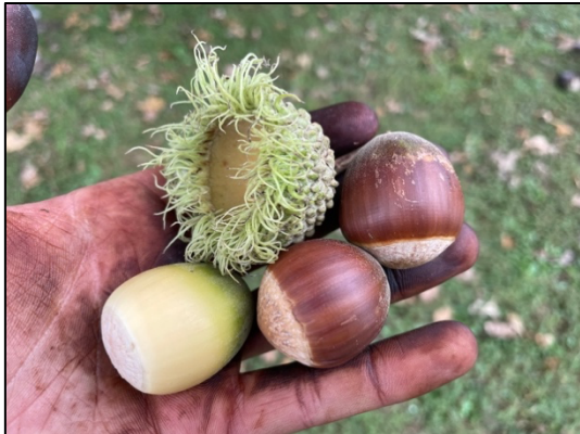
'MidMo 1' a precocious, sweet acorn, at the home of Lucky Pittman.

Oaks present many challenges to the breeder. These issues need to be overcome, and indeed there are oak cultivars that contain some of these traits, but to my knowledge it is only in Spain that we see cultivars which show them all. The biggest challenges are: waiting many years to bear acorns, producing low yields, and yielding only once every few years. Bitterness is sometimes, but not always, considered a limitation to be overcome. Keep in mind that all of these traits are relative when it comes to the cultivars currently available in the US: “high yield” may still be well below chestnuts, “annual bearing” may still be somewhat irregular, “low tannin” or “sweet” may still require leaching out of tannins, etc.