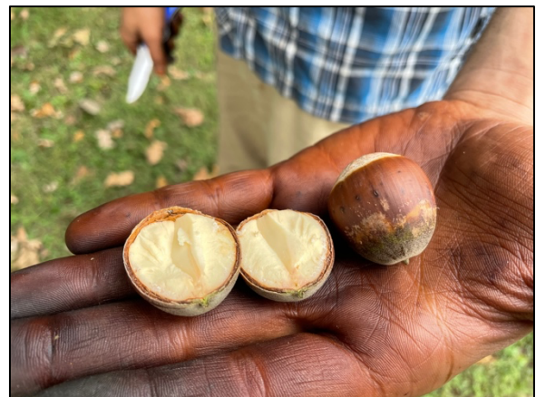
‘Ooti F1’.