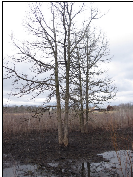
Burr oak demonstrating tolerance of flood and fire. This species is the most common parent of US cultivars.

There’s not that much information in books or online, so I interviewed some key experts. While this is the story of oak development, it’s very much the story of the human “crop champions” who have carried the baton for their part of the centuries-long relay race of domesticating the oak as food.