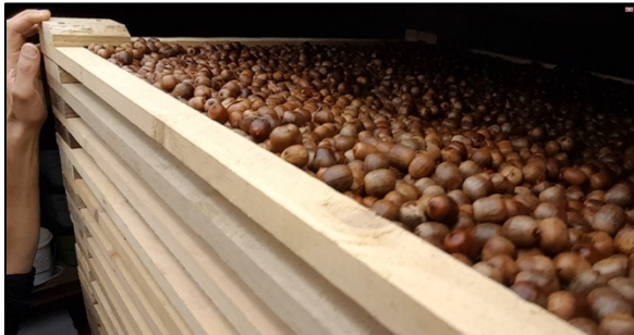
Sweetness is not the only desirable trait. High-tannin acorns like these from red oak store better.

Sweetness and flavor. Absence of bitterness is not the only trait that matters for human consumption. Oak enthusiasts have selected cultivars with superior flavors, including ‘Manna’, ‘Nutty’, ‘Antigua’, and ‘Orta.’