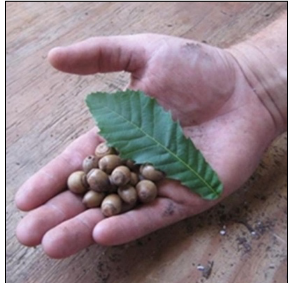
Small but productive acorns of 'Gobbler'.

Oaks for oil production. This is a category that does not appear to be actively under development: oaks as oil producers. Some species have high levels of oil, referred to by Sam Thayer as the 'orange flesh' group of oaks. These are characterized by small acorns and orange flesh, with oil content of 35-55%. Species suited to oil pressing