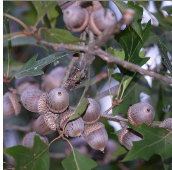
'Shuwater', selected by Dudley Phelps, has high tannins but is annual bearing with large acorns and high yields. A promising cultivar for oil production.

consumption. Some orchards in the region produce Q. acutissima and Q. serrata for processing in these facilities. Yield, precocity, and annual bearing are far more important than low tannin for this group of cultivars. We were not able to obtain names for either the Korean or Spanish cultivars selected under these criteria, nor are they easily available here. Meanwhile the cultivars listed below for wildlife and livestock should serve the same purpose. Even sweet acorns have tannins and phytic acid. These can be toxic in several ways, including limiting your ability to digest