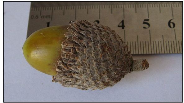
Q. brantii , cultivated in Kurdistan. Centimeter scale.

Do please let me know if you are aware of work breeding oaks to feed people, livestock, or wildlife elsewhere in the world.