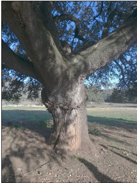
A grafted oak in Mallorca, where this is an ancient tradition.