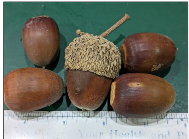
'McDaniels Burenglish' is a sweet, high-yielding hybrid oak cultivar. Inch scale.

random mix of hybrids with three or more species in their genes. In areas with oaks already (at least oaks likely to cross, for example in the white oak group), hand-pollination would be necessary to obtain guaranteed hybrid progeny. Hand pollination would probably be needed even in areas without other oaks, to obtain certain very desirable crosses. Neohybrids can exhibit an astonishing diversity of traits and represent a treasure trove of potential from which to select new cultivars. When wild or cultivated species growing in proximity cross with each other again and again, they form a hybrid swarm : a population of hybrids, interbreeding and backcrossing with their parents. This is not only a natural way new species are formed, it is also how many of our crops were developed, from corn to wheat to beans. Phil Rutter lays out a whole neohybrid tree breeding program in Growing Hybrid Hazelnuts that could serve as an excellent roadmap for oak breeders.