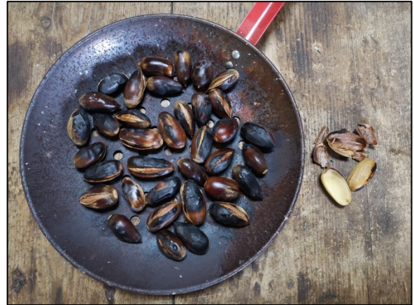
Roasted acorns of Q. rotundifolia ready to eat.

names or descriptions of these cultivars for this article.