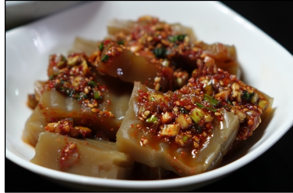
Dotorimuk, a popular acorn-based food in South Korea. Image CC BY-SA 4.0.

I was unable to obtain names or descriptions of these cultivars for this article. They are maintained by the Korea Forest Research Institute.