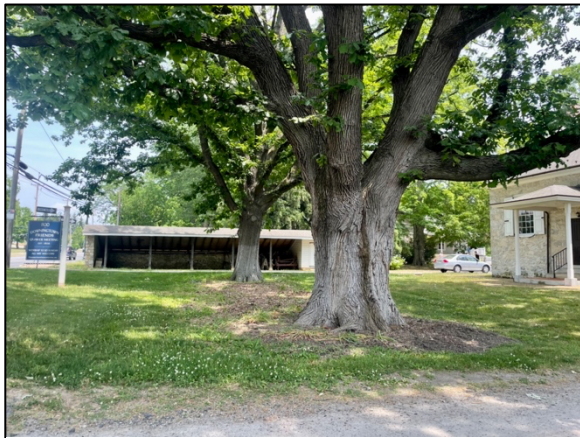
Grafted oaks from the Hershey planting in Downingtown PA. Noticeably lighter bark below the graft union.

was once his Pennsylvania farm is now suburbs, but many of the trees still stand. In the past few years a number of nut and fruit enthusiasts, including oak crop champions, have been collecting seed and scionwood from the mature plus trees. Dale Hendricks of Green Light Plants tells me that while some of these cultivars are already available (like ‘Hershey’), there are many more waiting to be released. Buzz Ferver of Perfect Circle Farm is propagating many of these elite oaks including the ‘CDS’ series. He tells me that often when they return to a tree to collect seed or grafting wood, they have been cut down.