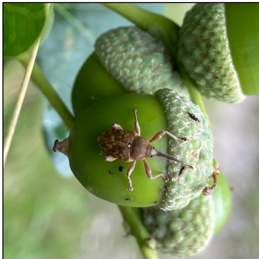
Weevils are a major pest of acorns. Fortunately many cultivars show strong resistance.