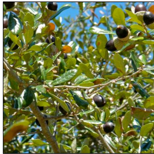
‘Late drop’ is a live oak with late acorns for winter wildlife (or livestock).

Acorn size. We often think bigger is better, and its true larger acorns can be easier to harvest and for certain kinds of processing. Large cultivars include ‘McDaniels’ and ‘De La Campaneta’. Yet wild and domesticated turkeys cannot swallow large acorns. ‘Gobbler’ was selected for high yields of small acorns to feed wild turkeys for hunting and conservation purposes.