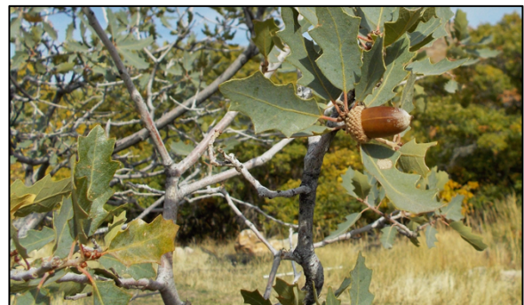
A Cottam hybrid of cork oak ( Q. suber ) and the western native Q. turbinella at Cottam Grove in Utah.

The Cottam grove also contains hybrids of western oaks crossed with each other. These could save western oak enthusiasts a lot of time in getting started. There are hybrids of shrub live and interior live oak, shrub live and valley oak ( Q. lobata ), and more. Many of the hybrids in the collection are of unknown parentage, but surely worthy of close examination.