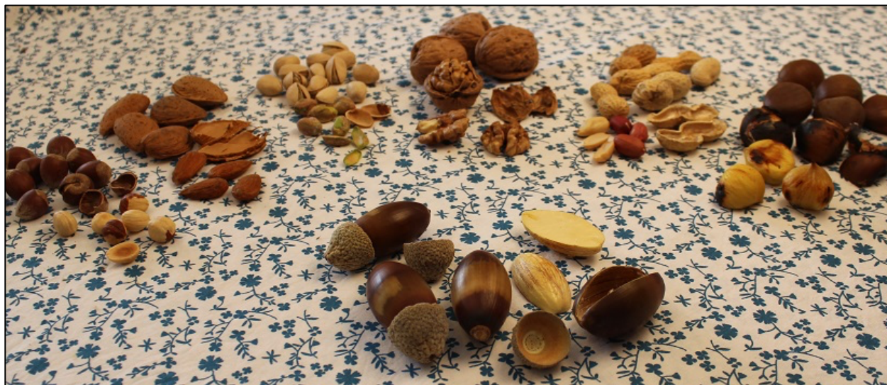
Can the acorn take its place alongside widely-grown staple crops like hazelnuts, almonds, pistachios, walnuts, peanuts and chestnuts, as shown here?

Perennial staple crops are trees and other perennial plants that produce starch, oil, and/or protein for human consumption and to feed to livestock. Oaks are but one of many such crops, from perennial grains like kernza to chestnuts and almonds. Some are already fully domesticated and widely grown, but they need to be much more widely adopted if humanity is to stay within its carbon budget and avoid catastrophic warming. Others, like oaks, are waiting patiently for humanity's attention. Perennial crops have many additional benefits as well, from soil health to water quality and wildlife habitat. I'll be hosting a workshop on perennial staple crops at my farm in Massachusetts, USA this fall. Visit perennialolutions.org to see my upcoming in-person events and webinars.