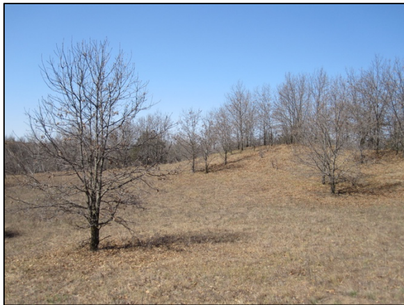
A restored, fire-managed oak savanna in Wisconsin. These productive landscapes were much more common under widespread Indigenous landscape curation before colonization.

In fact, there's some evidence that oaks, along with other nuts, moved north after the glacier receded quite a bit faster than they could have on their own. One theory is that Indigenous people helped these tree species by repeatedly carrying acorns north and planting them, some 8,000 years ago. The same phenomenon has been discussed with hazelnuts in post-glacial Europe.